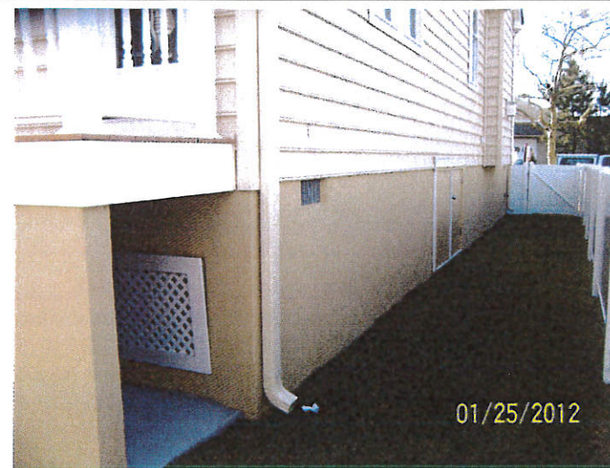
Left Side View – Date of Photograph: (See Photo Stamp)